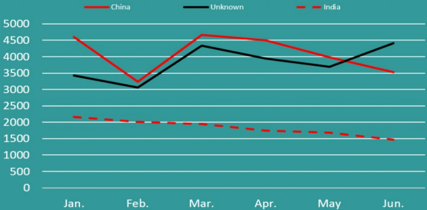
Fig. iii Edinburgh Research Explorer: monthly downloads by selected 'Countries', January 2019 - June 2019