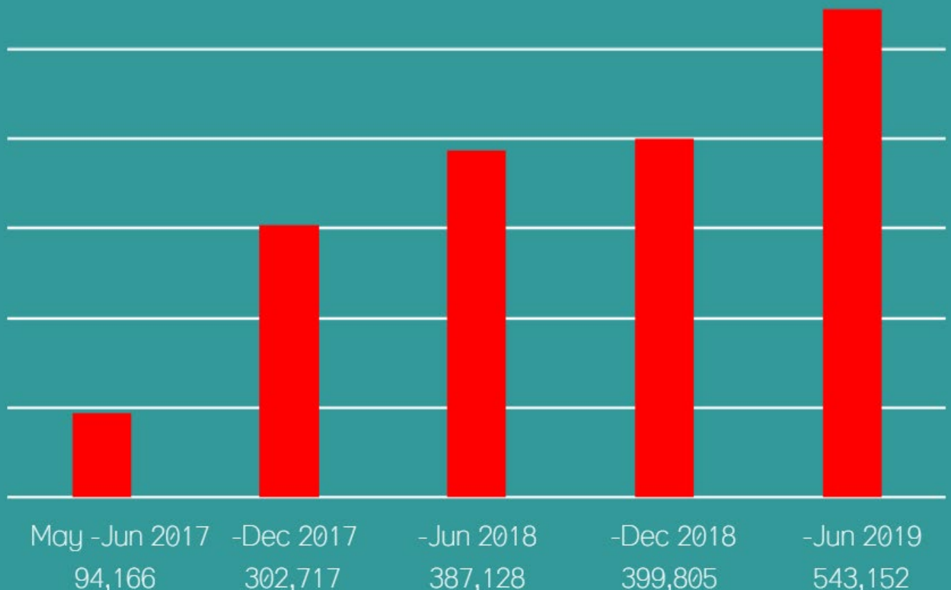
Fig. i Edinburgh Research Explorer: downloads May 2017 - June 2019, in six-monthly blocks

The first six-months of 2019, as now seems inevitable, have proved to be the busiest six-months in Edinburgh Research Explorer's brief history, with 543,152 downloads. This is not only the first time that the half-a-million milestone has been breached within such a short period, but represents a 35% increase on the previous best. As the chart below indicates, this rate of growth is unprecedented following a full 6-months: