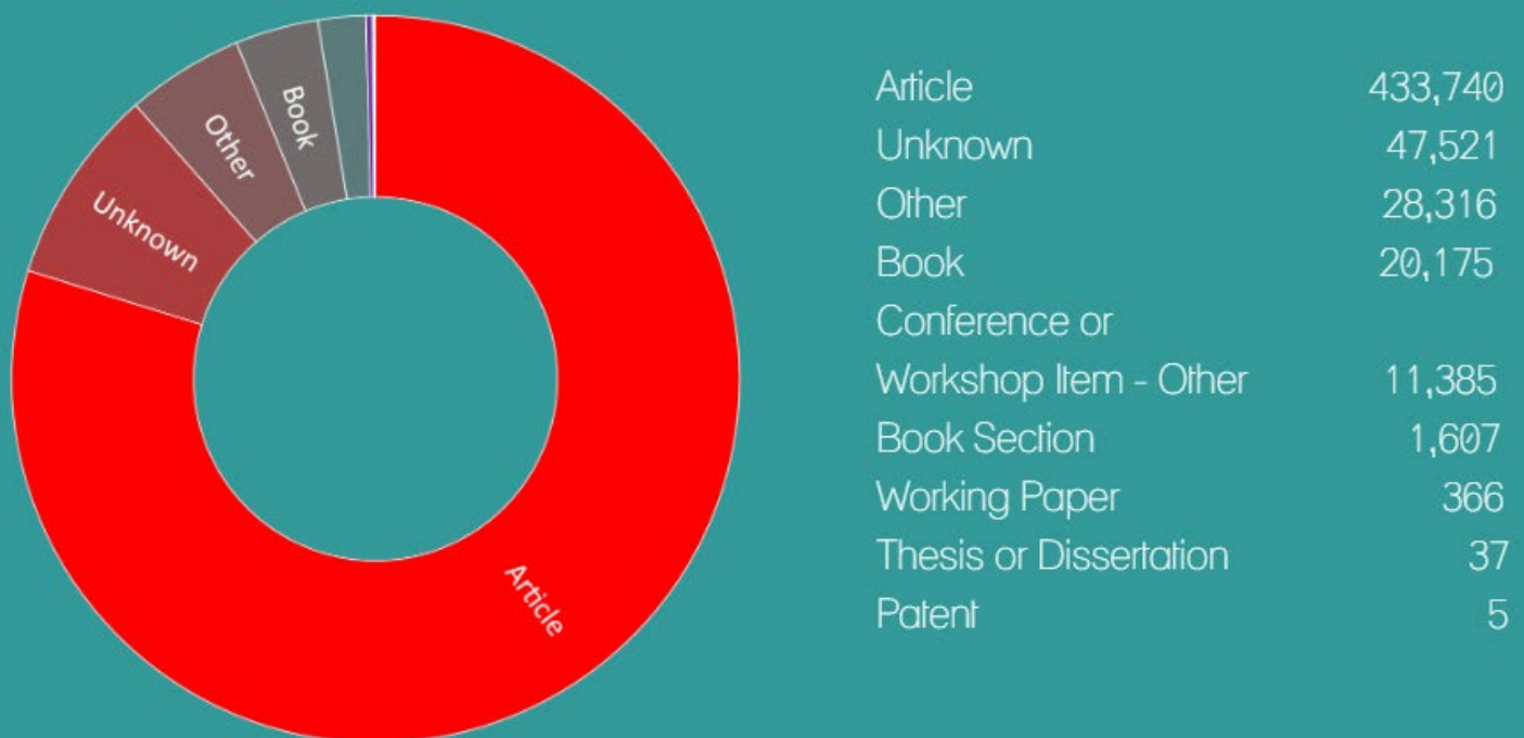
Fig. iv Edinburgh Research Explorer downloads by item-type, January - June 2019

Predictably, articles make up 80% of the item-types; 'Unknown' = 9%, 'Other' = 5%, Books = 4%, and Workshop/Conference Papers just 2%.